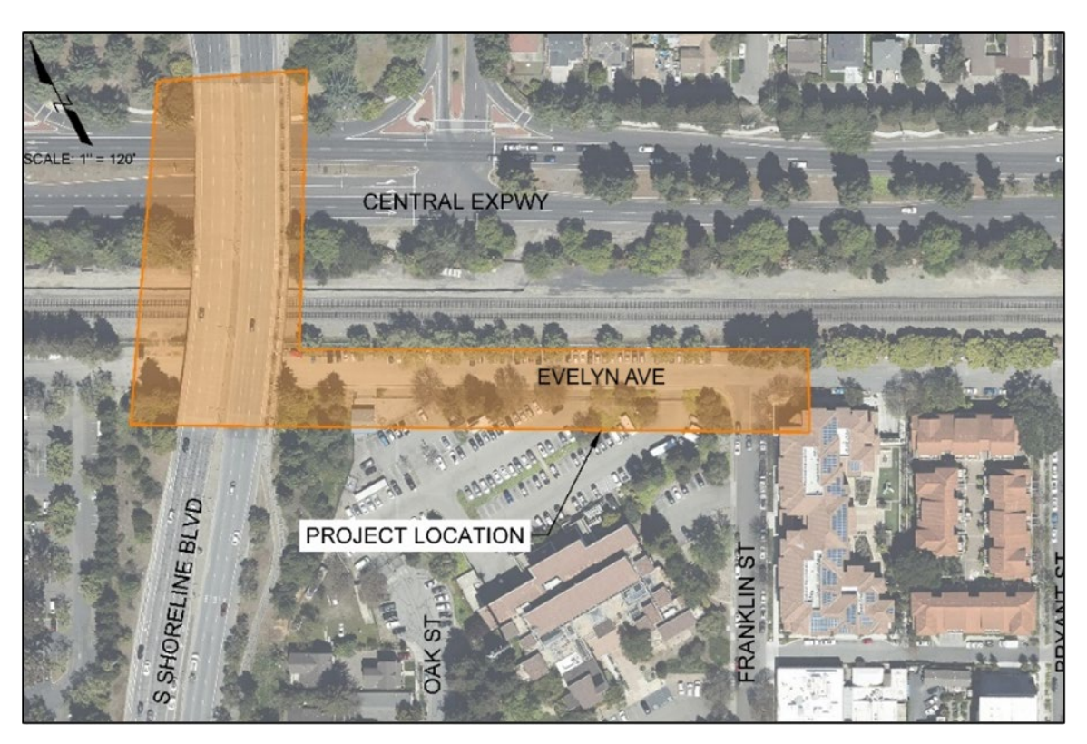
Figure 2: Castro Street Grade Separation Footprint—Evelyn Avenue Ramp