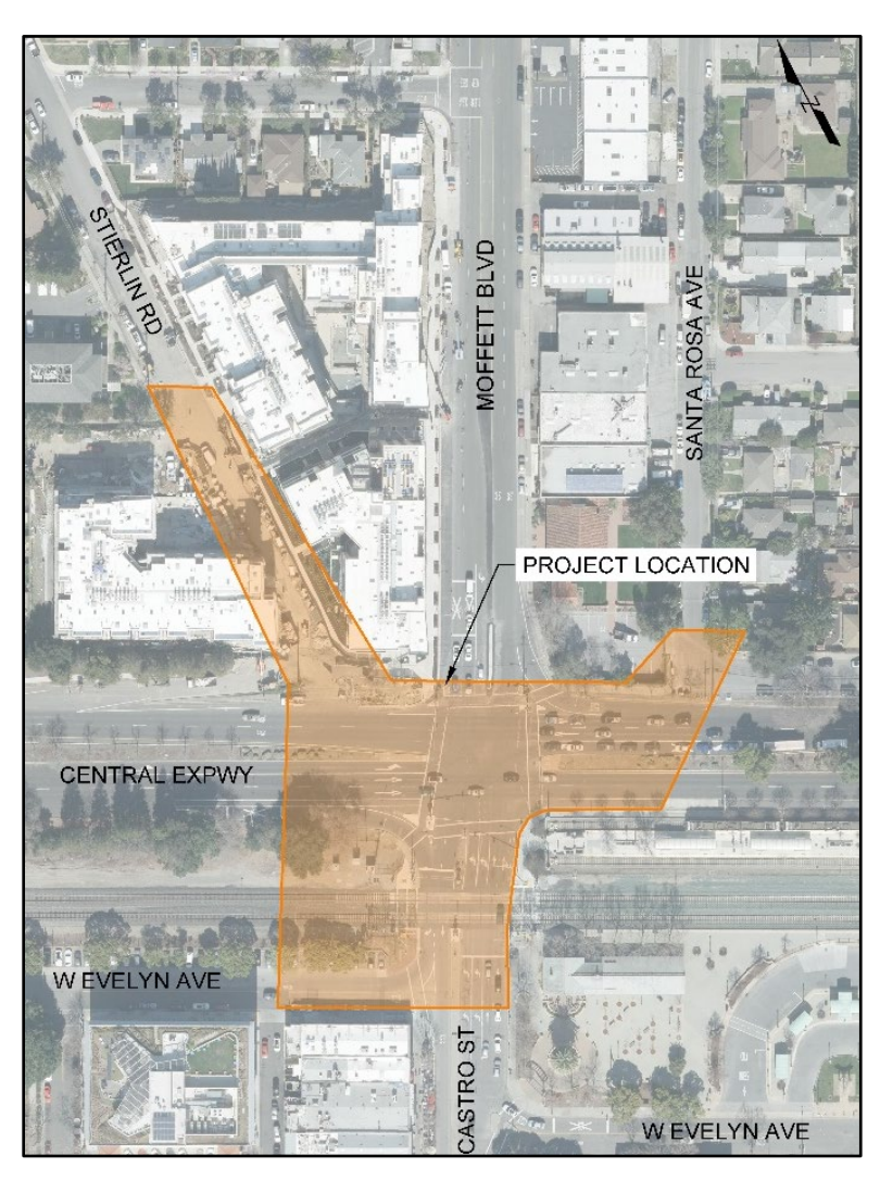
Figure 1: Castro Street Grade Separation Footprint— Central Expressway/Moffett Boulevard

The future Phase 2 Utility Project will relocate water, sewer, and storm drain mains on Evelyn Avenue west of Franklin Street for the Evelyn Avenue ramp and pedestrian/bicycle path (see Figure 2). Staff will return to Council at a future meeting once the Phase 2 Utility Project is identified as needing to move forward based on the timing and sequence of the Castro Project elements.