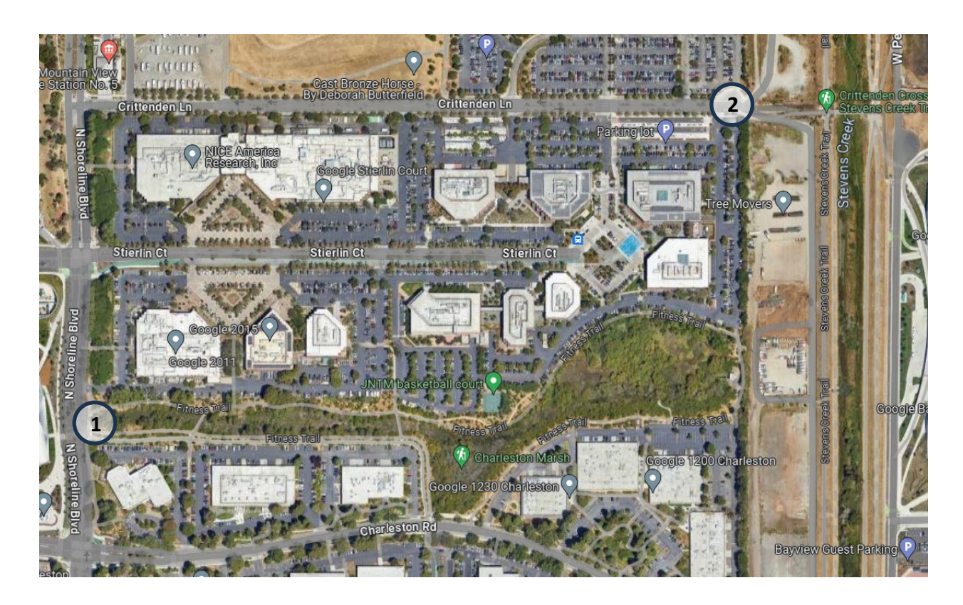
Figure 4: Overhead View of Other Art Opportunity Locations

Being outside of Shoreline Park, the lesser restrictions will allow for more flexibility in art selection and possibly more prominence. Should the Committee approve an allocation of funds towards Public Art outside the Boathouse Expansion, Staff will bring this item back for discussion to the VAC in the Fall 2024. At that time, more detailed options and recommends could be discussed for a separate Call for Artists. Consideration for this future Public Art project would run separately from the Shoreline Boathouse Expansion project allowing for a less constrained schedule.