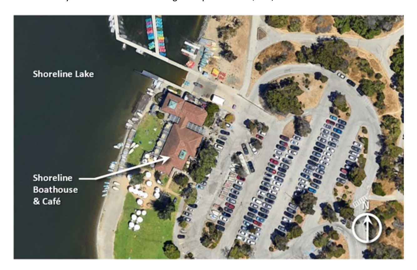
Figure 1: Project Site

As identified to Council on June 27, 2023, an additional amount of $108,000 will be added to this budget from Fire/Police Training and Classroom Facility at Fire Station 5, Construction, Project 20-35, that did not have appropriate locations for public art installation at the Fire Station 5 facility. The use of the reserved funds from the Fire Station 5, Project 20-35, must be used within the North Bayshore area. The total budget for public art is $162,200.