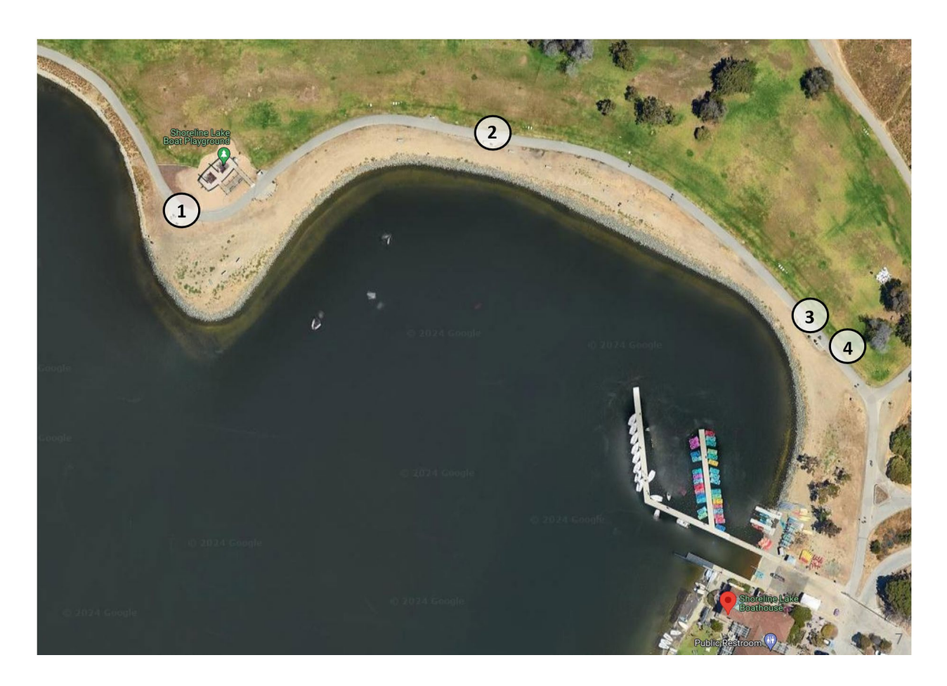
Figure 3: Overhead View of the Lakeside Path Bench Replacement Locations