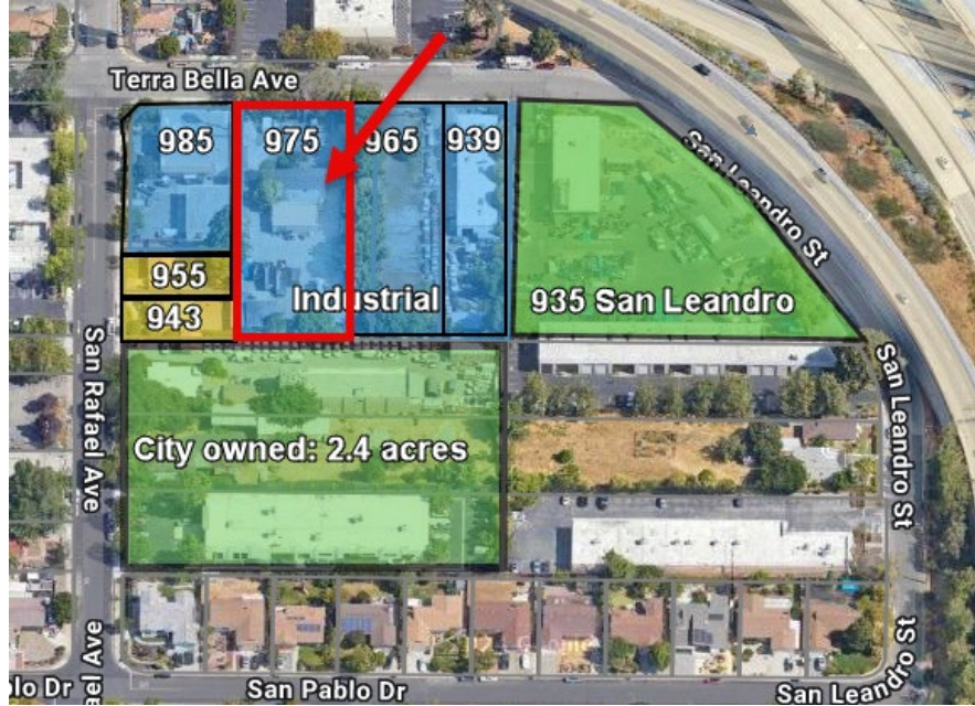
Figure 1: Location of 975 Terra Bella Avenue

The City has undertaken standard acquisition due diligence for the property, including environmental review and title review.