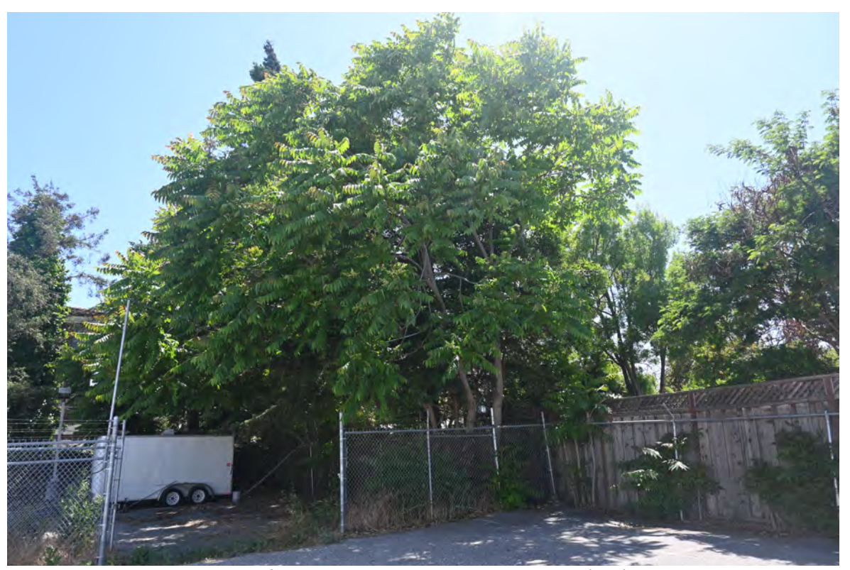
Tree-of-heaven cluster on adjacent property. (#32)