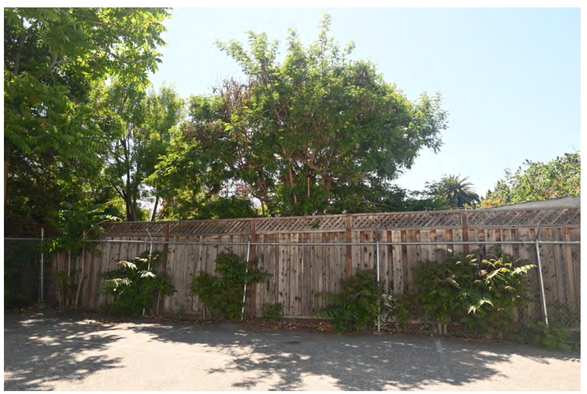
A white lead tree is growing on the adjacent property. (Tree #33)