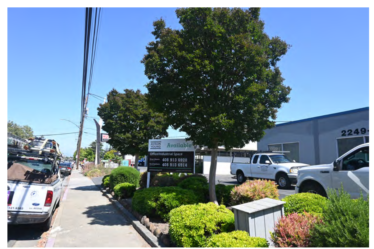
Crape myrtle street trees. (Trees #34 and #35)