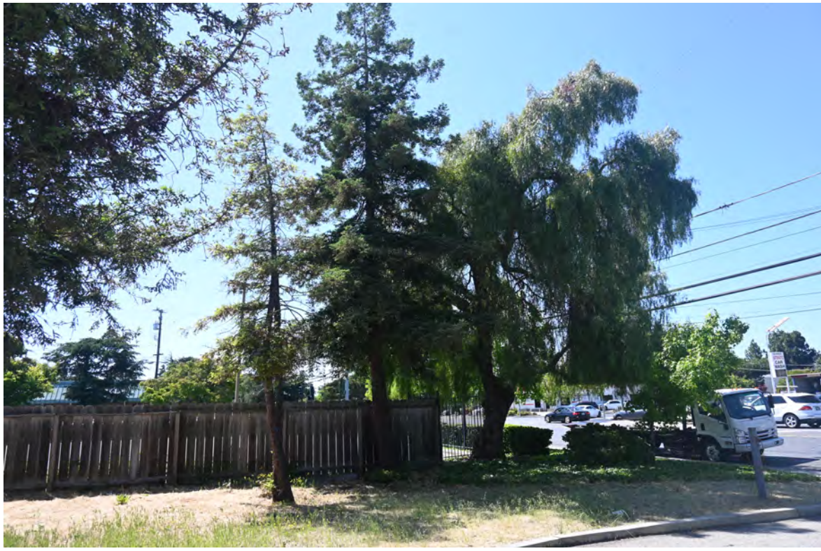
Peruvian pepper, tree #9., and coast redwoods #10 and #11.