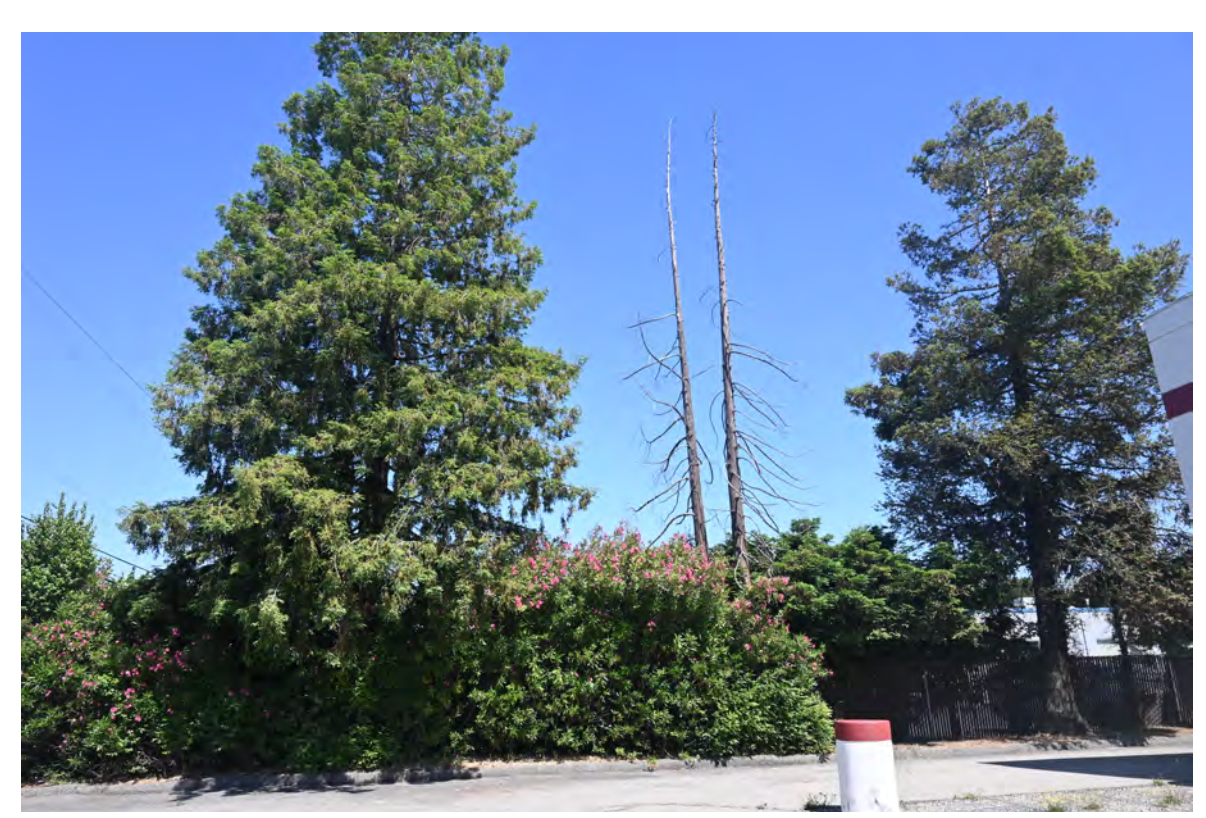
Redwoods #15, #16, and #17.