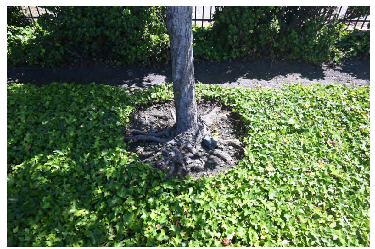
The surface rooting typical of liquidambars often causes pavement displacement.