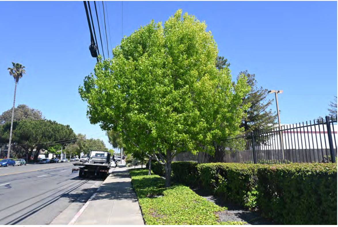
One of the four liquidambar street trees on Old Middlefield Way. The trees are in variable condition.