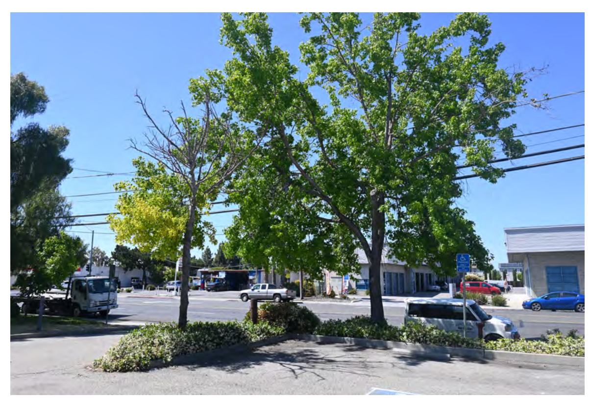
Liquidambars #13 and #14.