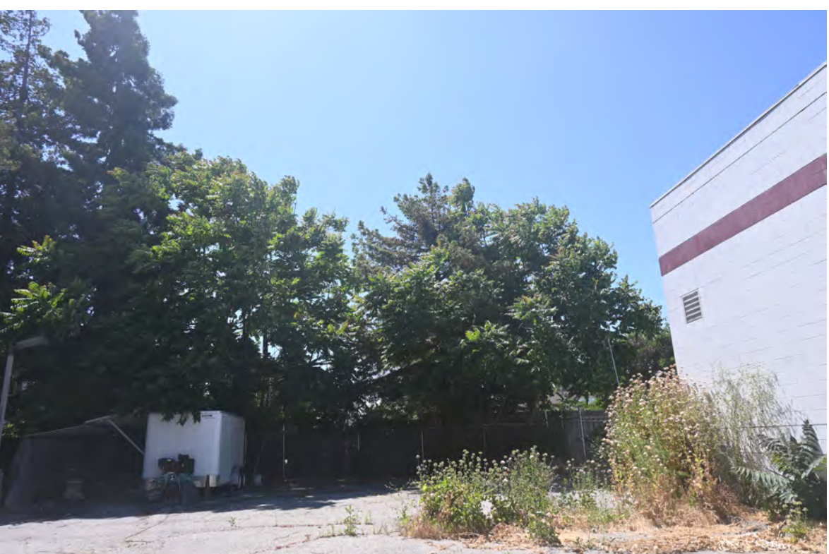
Redwoods and tree-of-heaven are growing on the adjacent property in the south portion of the project site. Trees #28- # 32.