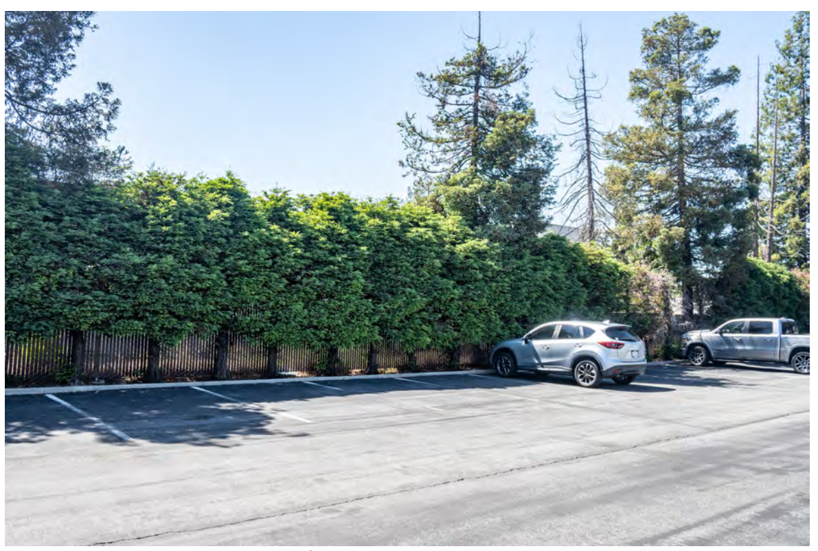
A hedge of redwoods borders the parking lot.