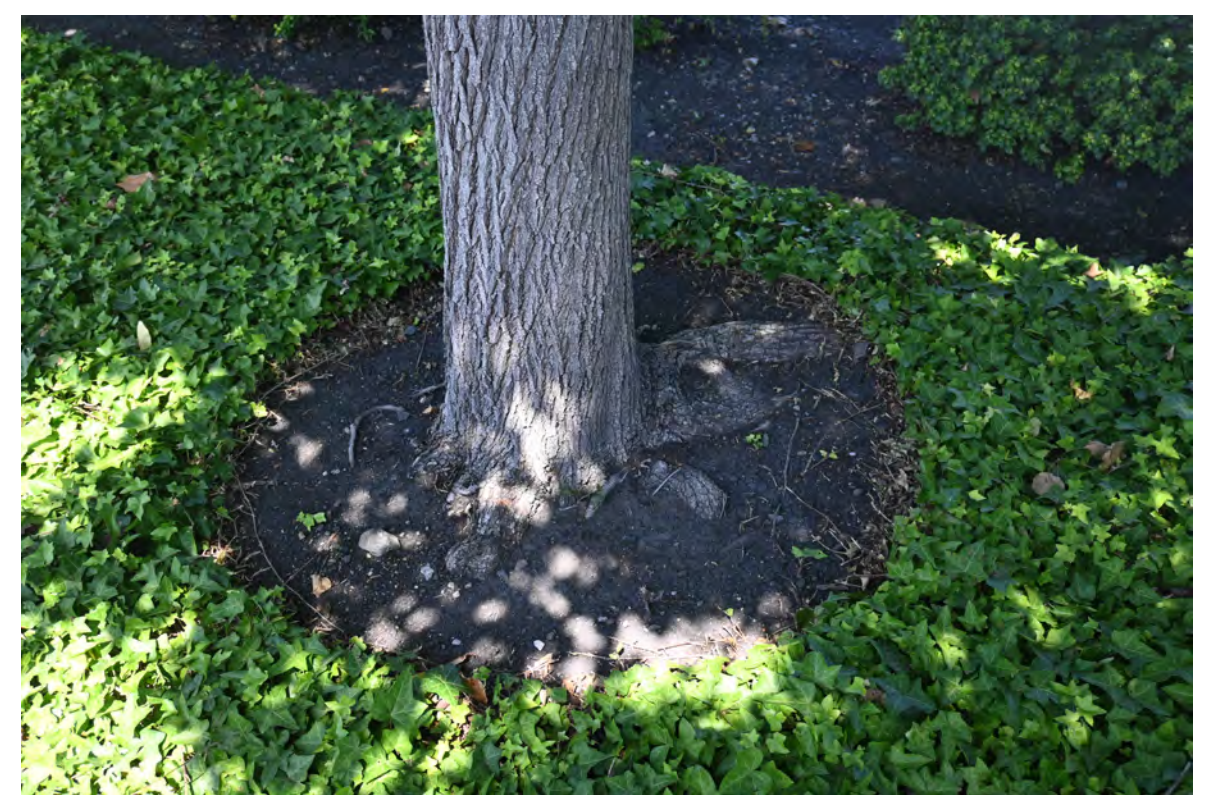
The asymmetrical root system of a Bradford pear. This defect does not appear to be affecting the health or stability of these trees.