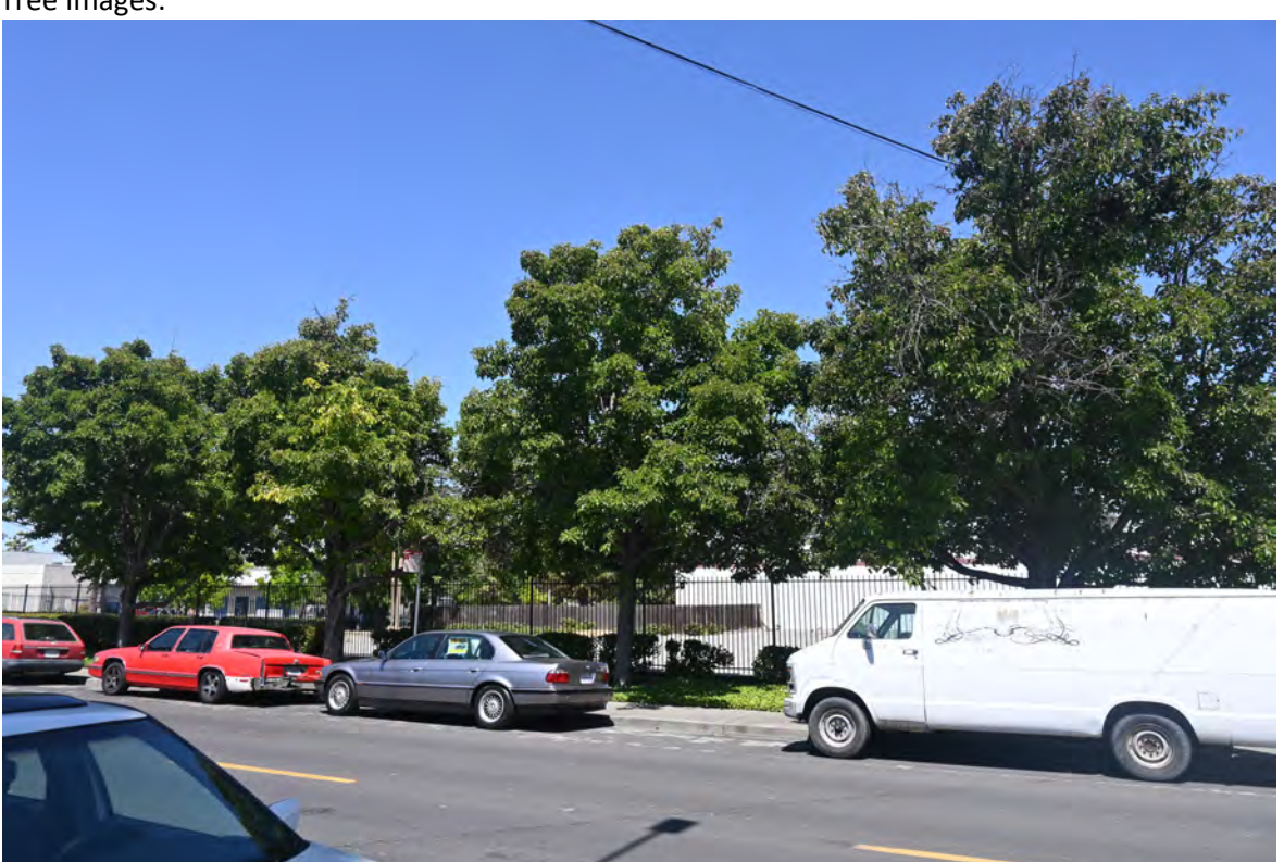
Bradford pear street trees growing along Independence Avenue.