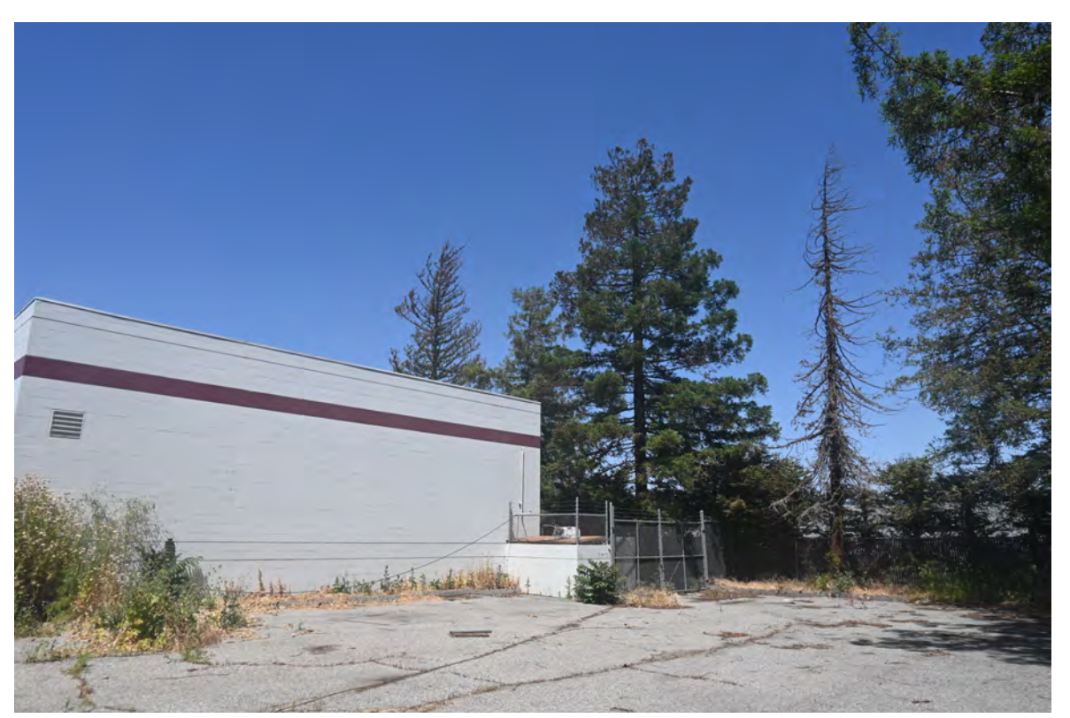
Redwoods, #21, #22, #22A, and #23.