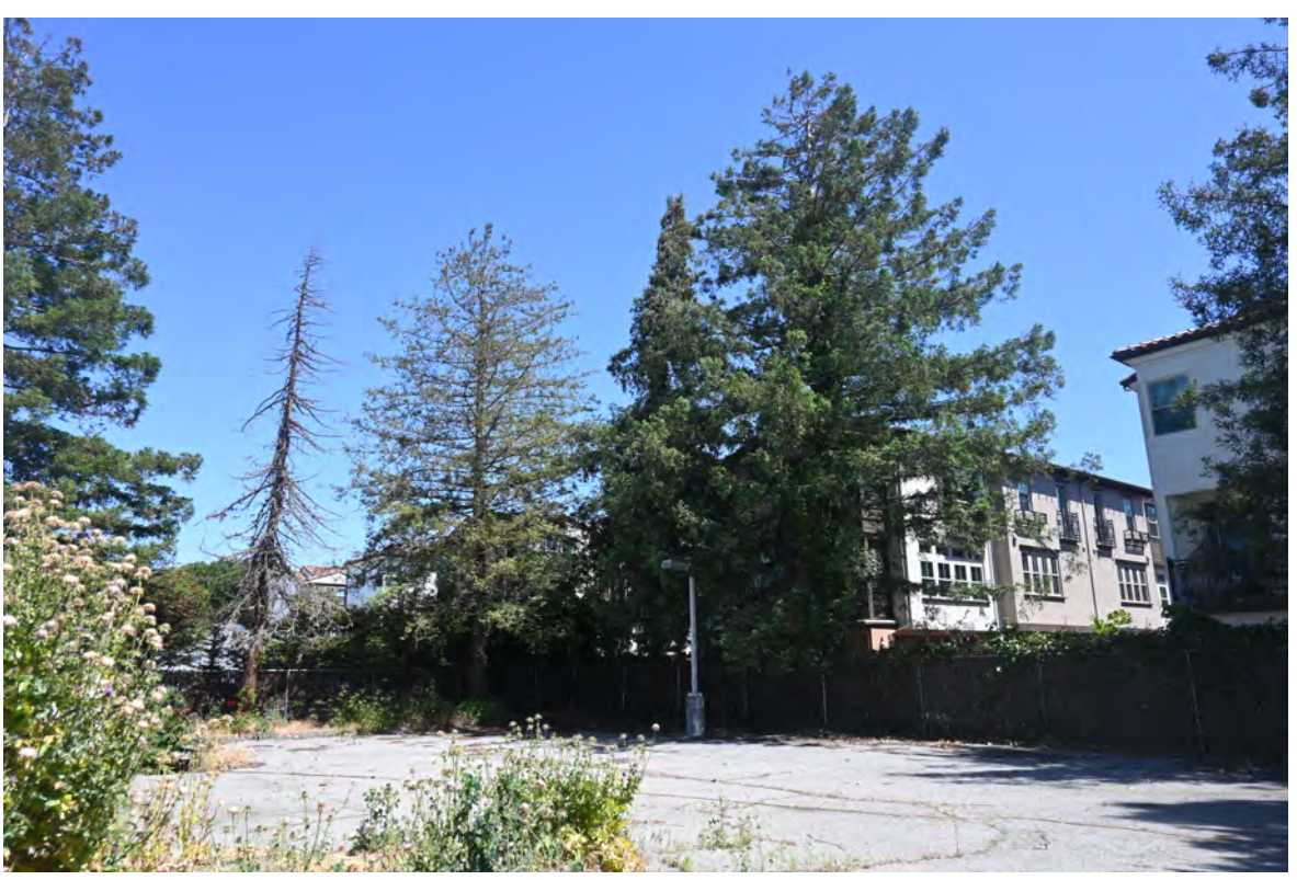
Redwoods along the south perimeter. Trees #23,#24, #25, and #26.