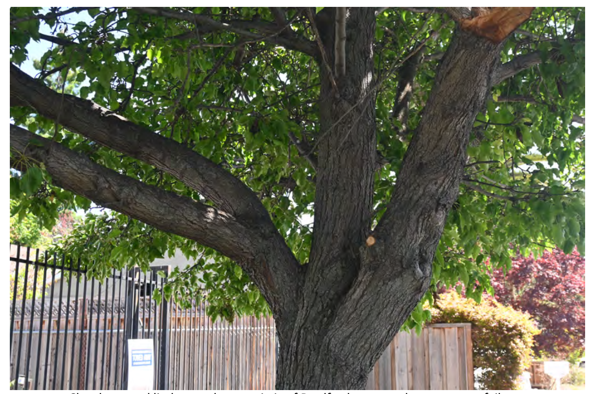
Closely spaced limbs are characteristic of Bradford pears and are prone to failure.