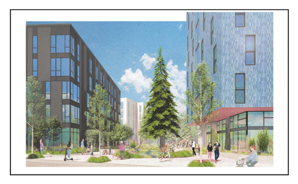
Figure 5: Charities Housing Proposal—Conceptual Community Plaza

Although the submittal showcased strong design elements, such as higher density situated away from existing lower density neighborhoods, ground-level nonvehicle circulation and potential shared open space areas, providing amenities for both tenants and the community, there were concerns from staff regarding how architectural variety would be accomplished as well as livability and convenience. In particular, the distance between the stand-alone garage and the residential units on the City-owned parcel raised issues. Moreover, Charities Housing was unclear about their ability to finance the construction of the stand-alone parking garage in Phase 1—which is intended to provide parking for all of the affordable housing units—well before the completion of the remaining units in Phases 2A, 2B, and 3. While the team expressed willingness to assess site options and parking plans based on City input, their plan assumes buildings that straddle parcel lines; however, the feasibility of straddling parcel lines would require further evaluation as part of the master plan process in coordination with VTA and Charities due to the continuing FTA interest on the Evelyn lot.