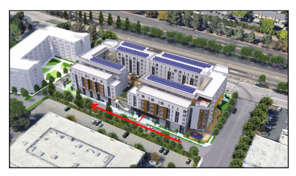
Figure 16: Core/Eden Housing Proposal—Aerial View of Project