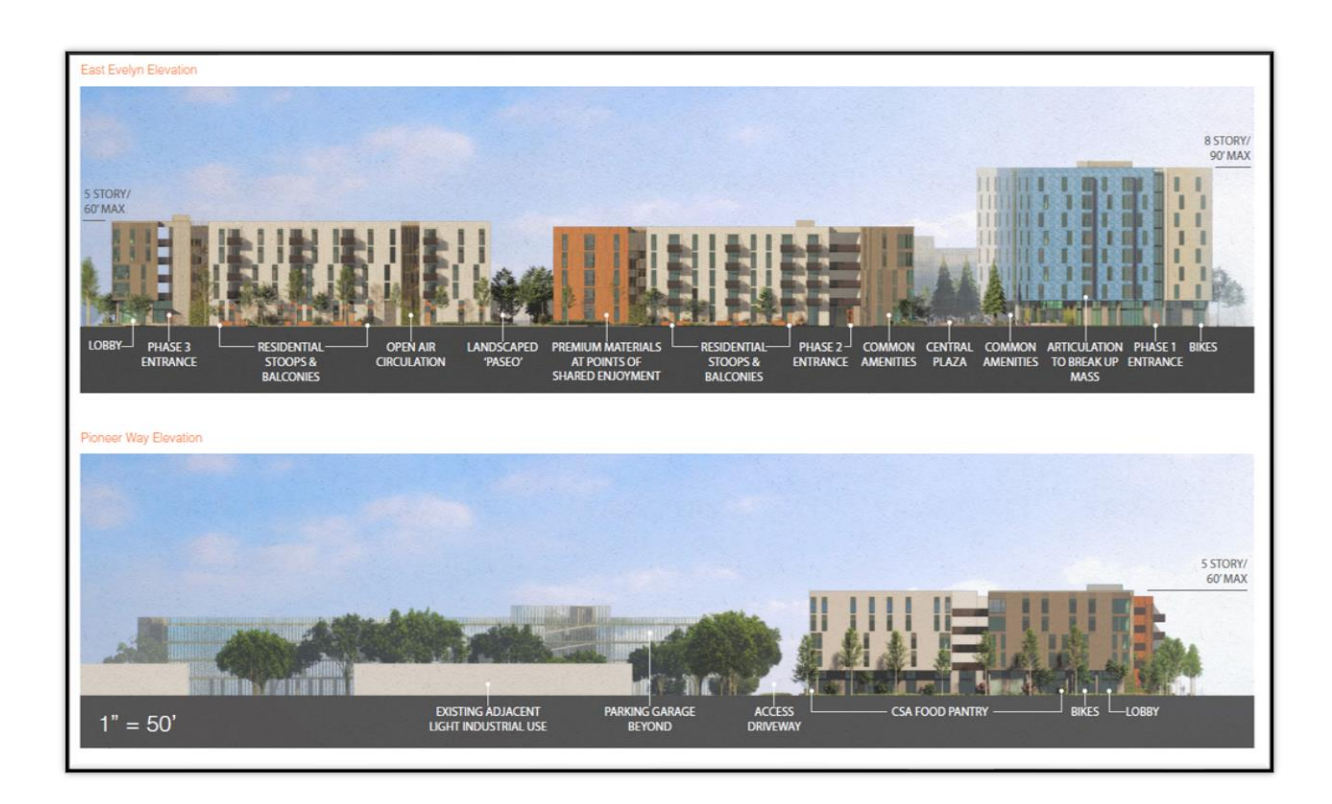
Figure 7: Charities Housing Proposal—Conceptual Design