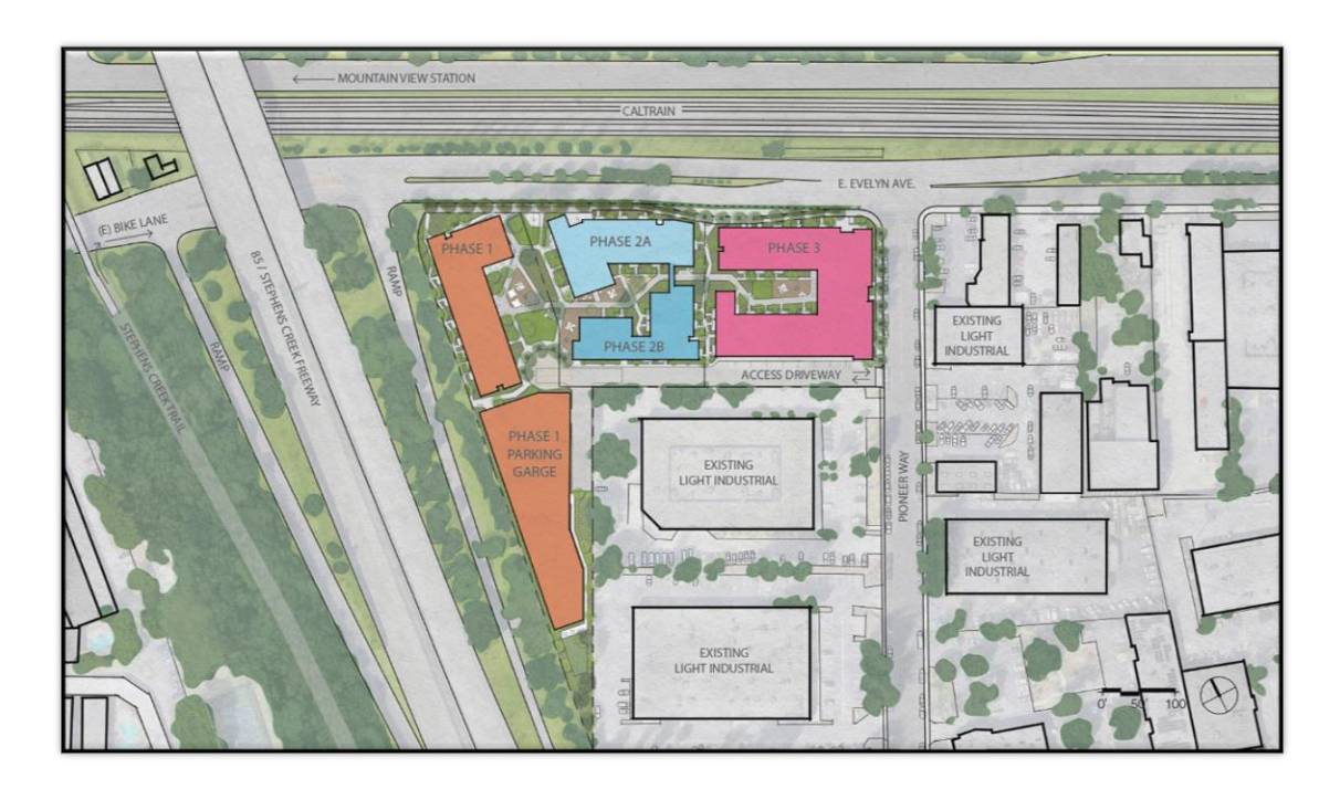
Figure 6: Charities Housing Proposal—Site Plan