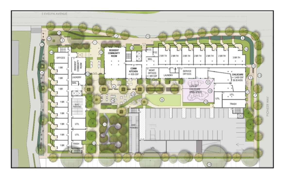
Figure 9: Alta Housing Proposal—Site Plan