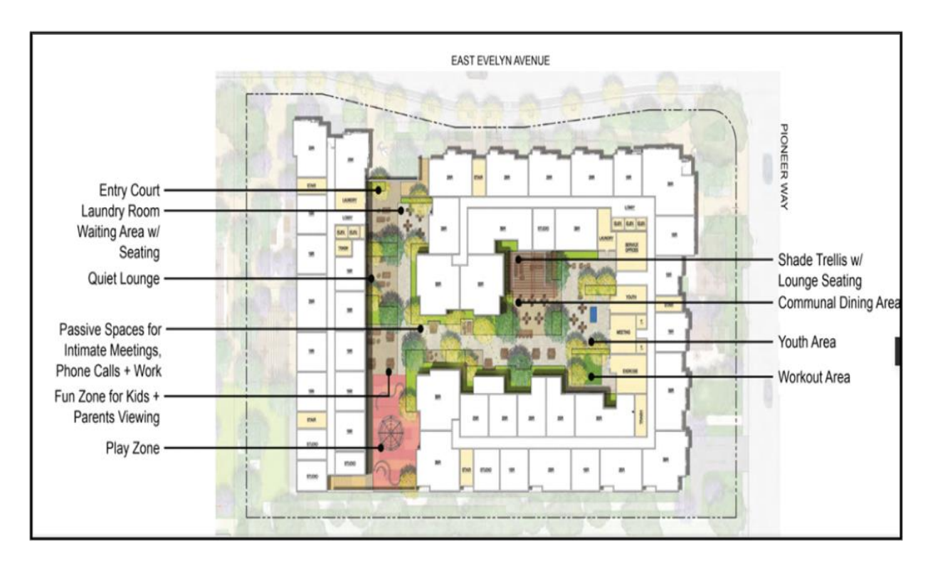
Figure 12: Bridge Housing Proposal—Site Plan

3. <u>Design</u>: The Bridge team plans to incorporate a variety of design elements to achieve an attractive and welcoming residential architectural character, including ground-level stoops and common amenity rooms, a regular pattern of vertical bays, modulating the building with setbacks and residential roof forms, and incorporating variation in high-quality building materials and colors. The six-story buildings are designed to be wood frame construction over a one-level concrete podium. The developer believes the PSH housing component could lend itself to modular construction for economy of scale.