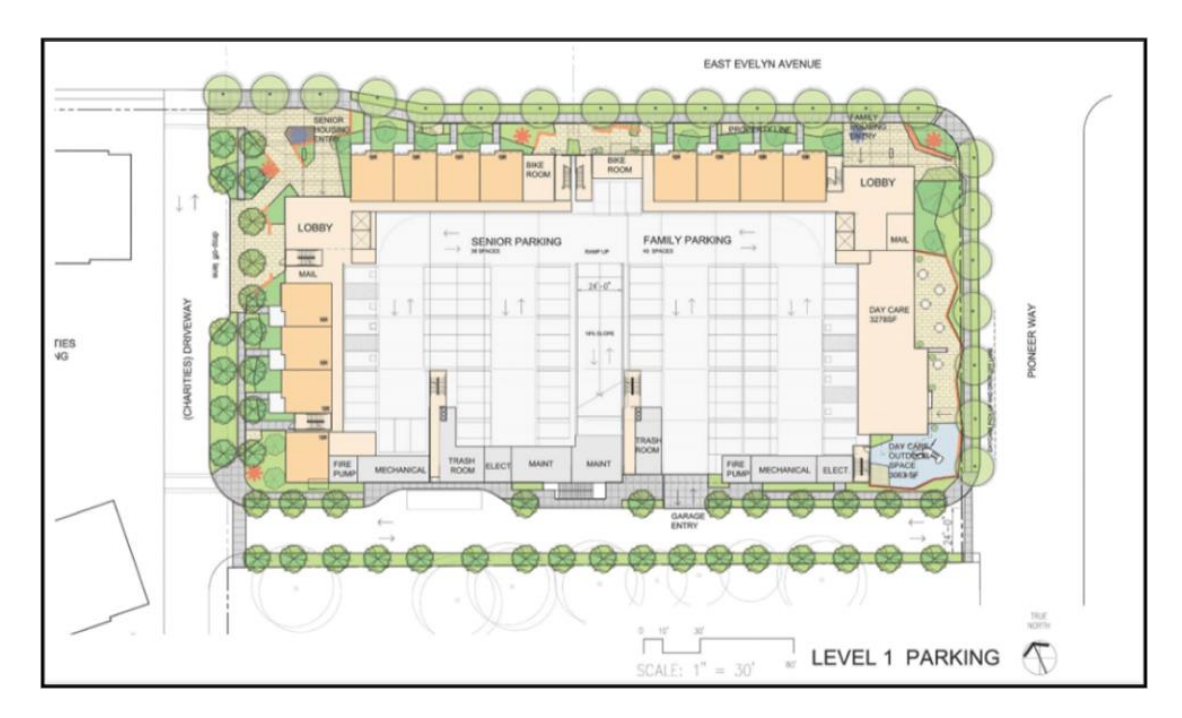
Figure 15: Core/Eden Housing Proposal—Site Plan