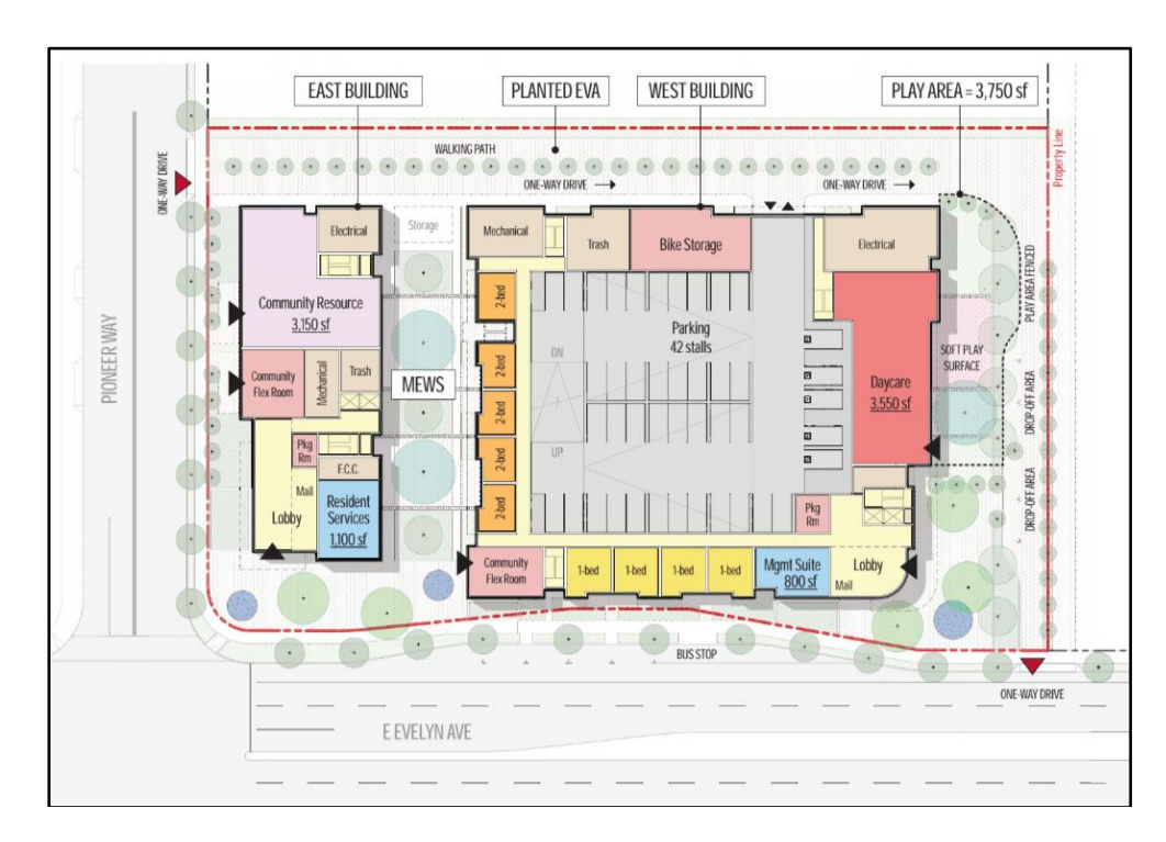
Figure 3: Affirmed Housing Proposal—Site Plan

2. <u>Site Plan</u>: The Affirmed Housing site plan features an "L-shaped" planted entry drive and emergency vehicle access (EVA), between Pioneer Way and East Evelyn Avenue, along with an open pedestrian mews between the two proposed buildings and connecting to a corner