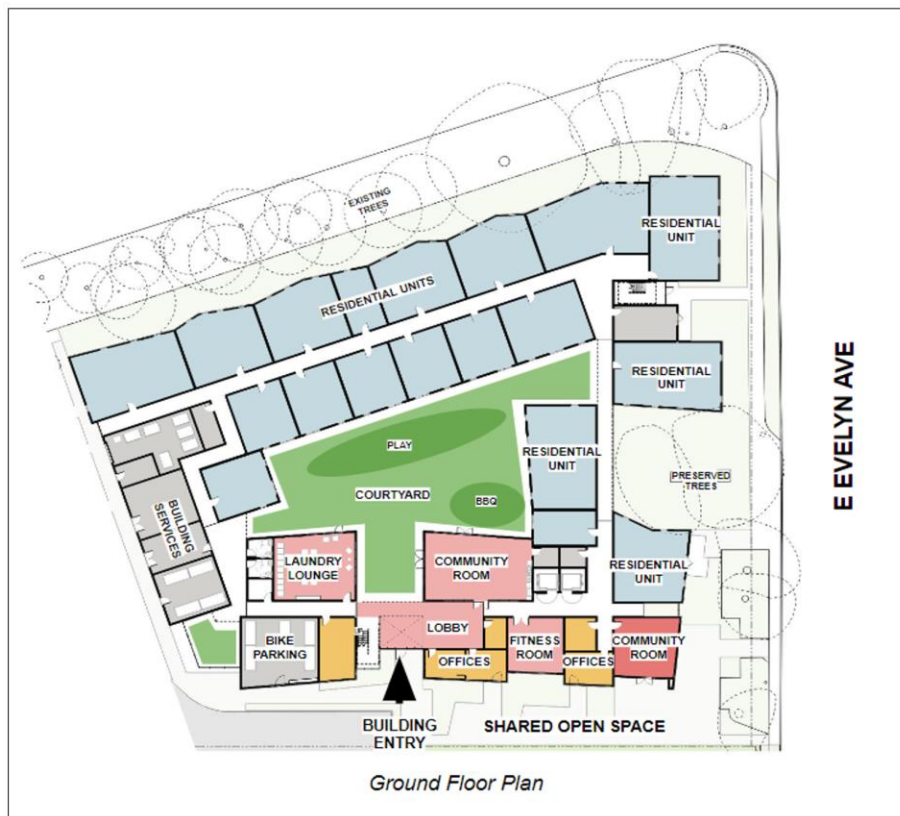
Figure 4: Amenities and Community Space

The Charities project includes amenities that prioritize engagement, recreation, and well-being. As shown in Figure 4 below, the first floor will house a community gathering room and a complementing small activity room for workshops or group activities. The development will also offer an on-site gym to promote wellness. A dedicated area for resident services is also located on the first floor. In addition, the site includes various outdoor amenity spaces, such as a children’s play area, landscaped courtyard, and picnic and barbecue area.