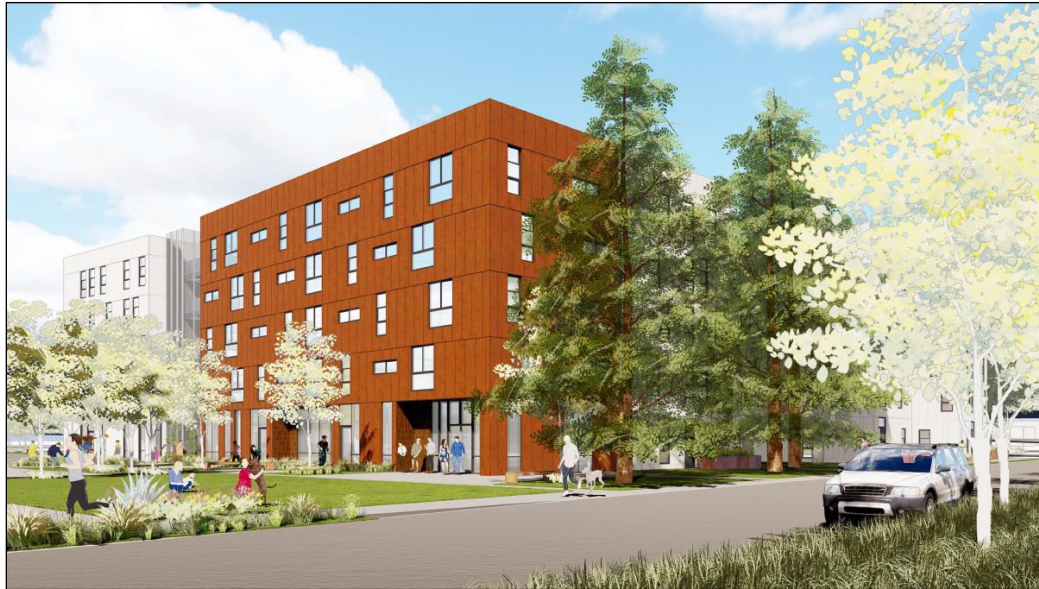
Figure 2: View from East Evelyn Avenue