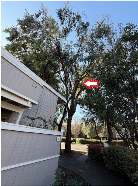
General structure and location of recent limb failure on Tree No. 1