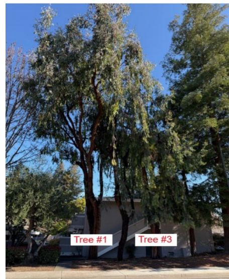
Street view which shows the trees of concern from the street