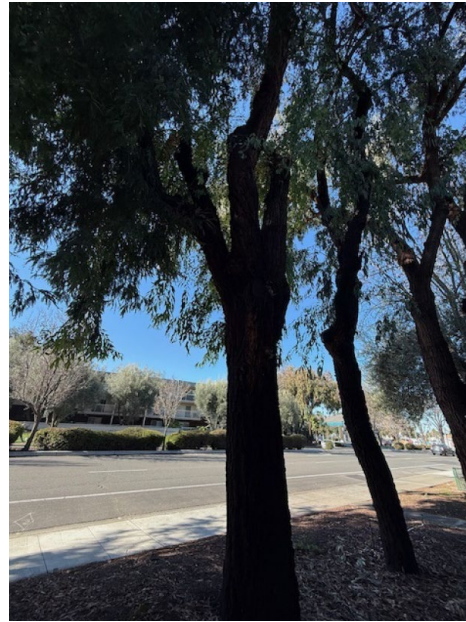
General structure of main stem and scaffold branches on Tree No. 3