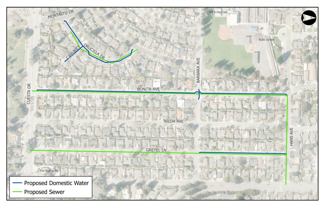
Figure 2: Drucilla Avenue, Carla Court, Bonita Avenue, Gretel Lane, Barbara Avenue, and Hans Avenue—Water and Sewer Main Replacements

Annual Water and Sewer Main Replacements, Projects 23-08 and 23-09—Various Actions April 22, 2025 Page 3 of 6