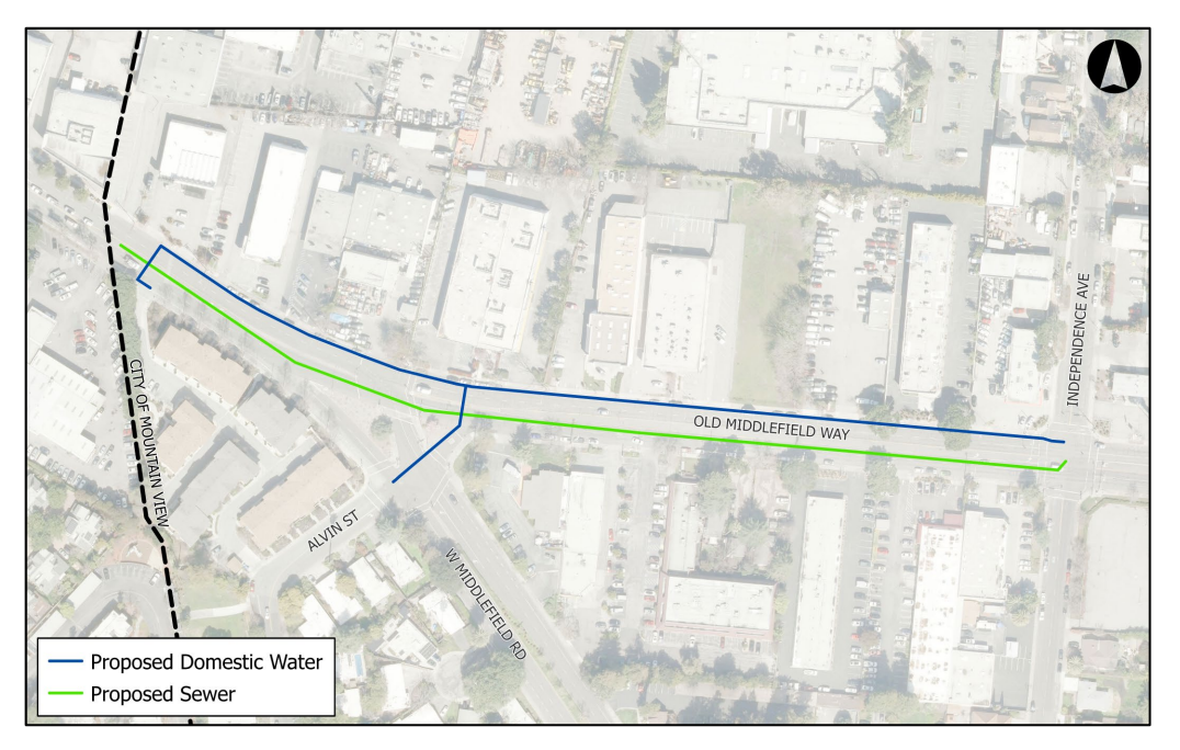
Figure 1: Old Middlefield Way and Alvin Street—Water and Sewer Main Replacements

Annual Water and Sewer Main Replacements, Projects 23-08 and 23-09, will replace approximately 5,323 linear feet and 7,063 linear feet of water and sewer mains, respectively, on Old Middlefield Way, Alvin Street, Drucilla Drive, Carla Court, Bonita Avenue, Gretel Lane, Hans Avenue, Barbara Avenue, and Martens Avenue (see Figures 1 to 3 for locations). The greater extent of sewer replacement needs is due to completed closed circuit television (CCTV) inspections, which identified a higher number of severe structural defects in sewer pipe within the project area. These defects in sewer mains were primarily due to pipe aging and degradation.