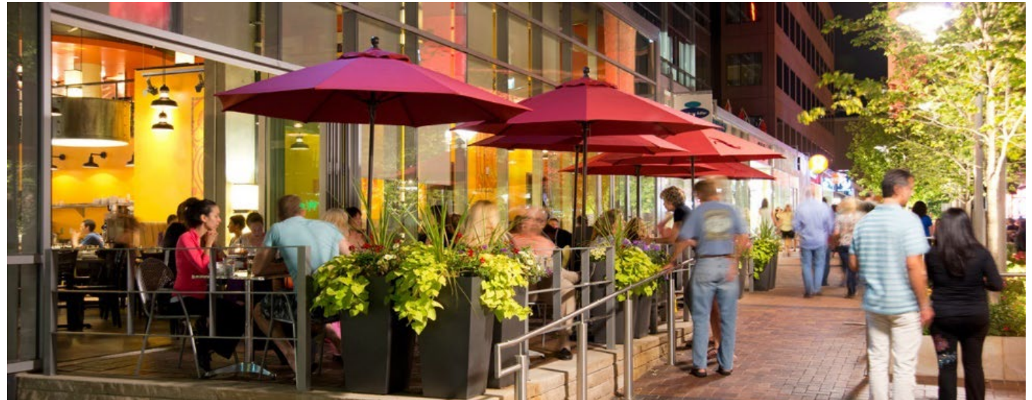
Precedent Imagery Examples