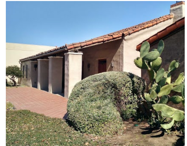
Precedent Imagery Examples