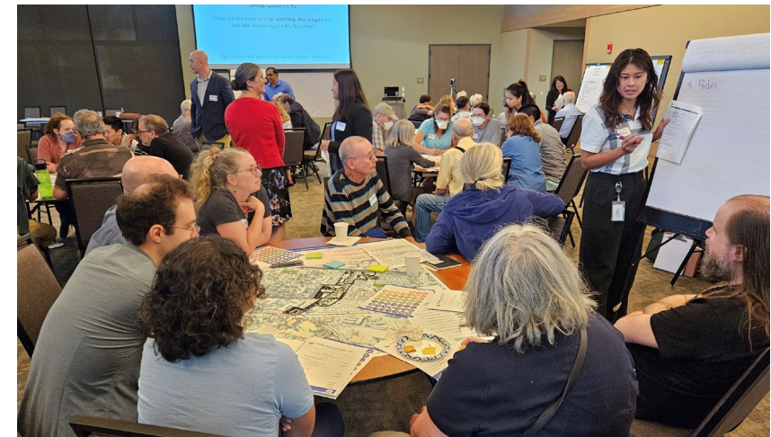
Community Visioning Workshop, August 28, 2024 Mountain View Community Center