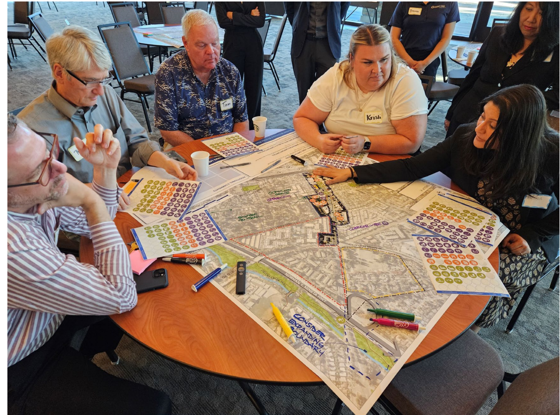
Property Owner/Business Owner/Business Association Stakeholder Meeting, September 4, 2024 Mountain View Community Center

The first meeting was with property and business owners, and the second meeting was with Mountain View-based organizations and associations.