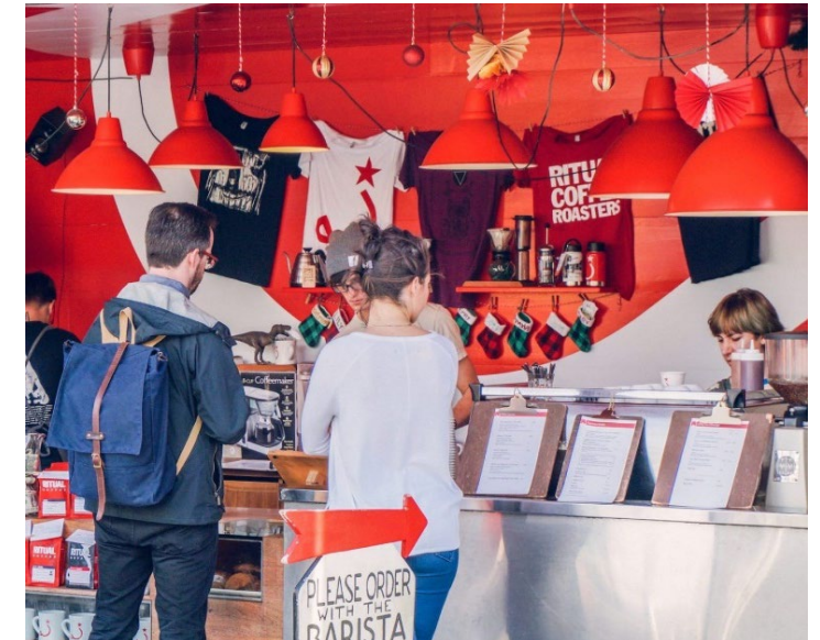
Precedent Imagery Examples