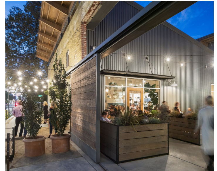
Precedent Imagery Examples