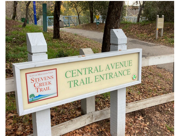
Precedent Imagery Examples