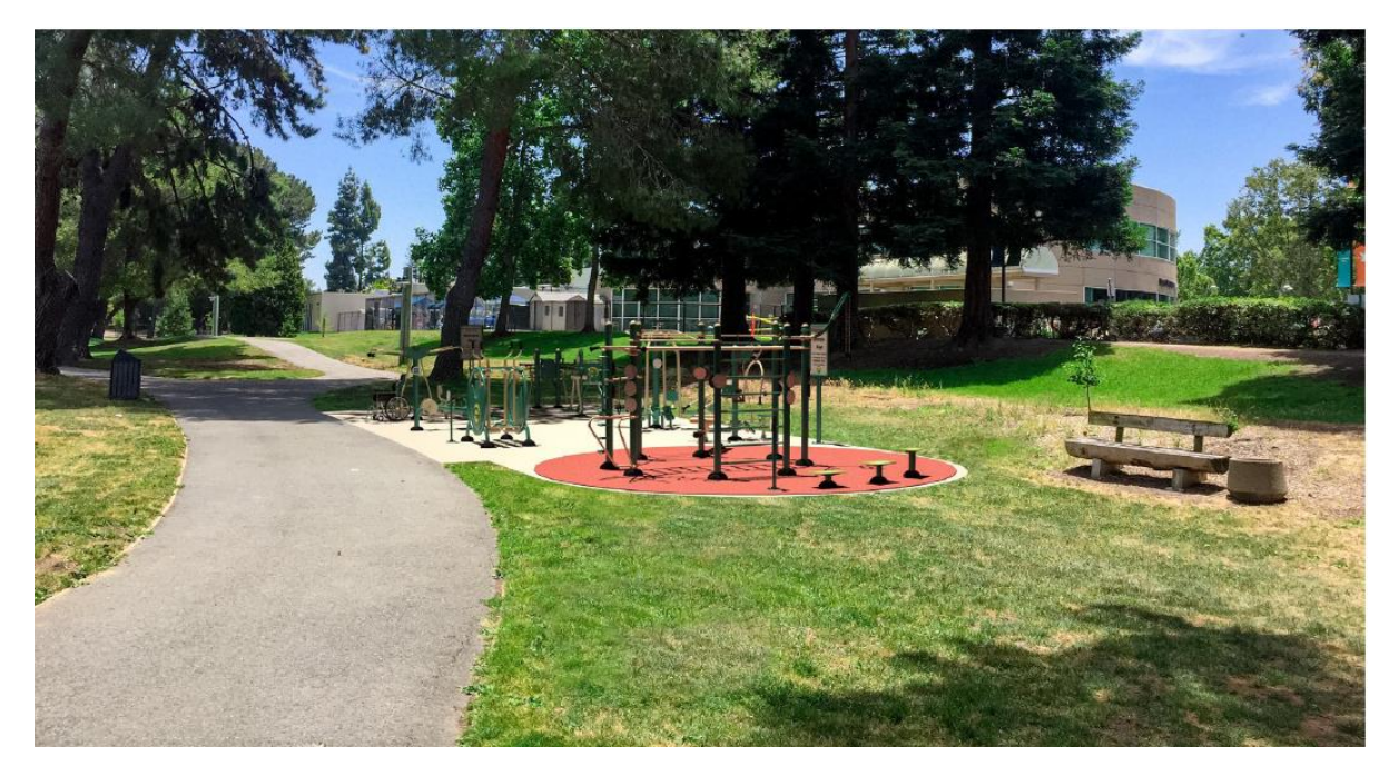
Figure 2: Concept Rendering Looking Southeast

Staff coordinated with outdoor fitness equipment manufacturers about design concepts and developed several alternatives in consultation with ECH staff. The alternatives were refined to one preliminary concept utilizing Greenfields Outdoor Fitness Equipment (see Figures 2 and 3).