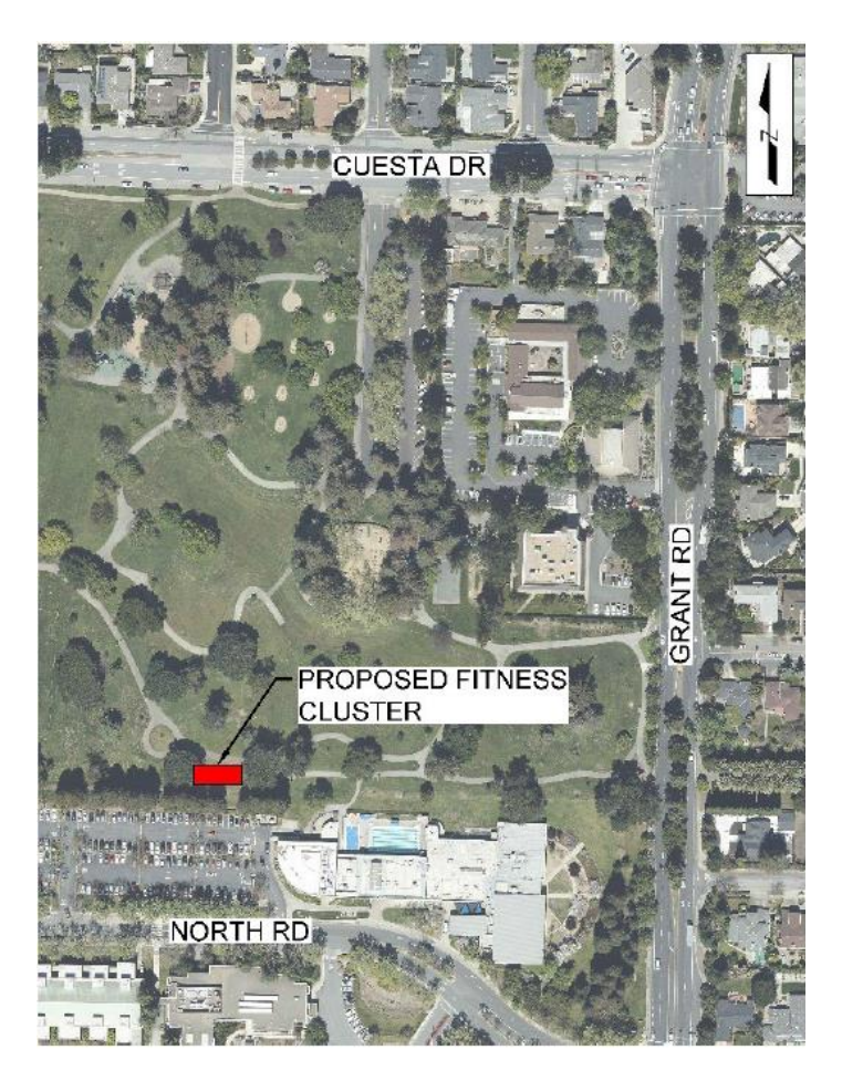
Figure 1: Location Map in Cuesta Park

Staff contacted El Camino Health (ECH) to gauge interest in partnering with the City on the project given its proximity to ECH facilities and the project's health-related mission. After discussing the exact location, approval timelines, and other details, ECH staff agreed to participate.