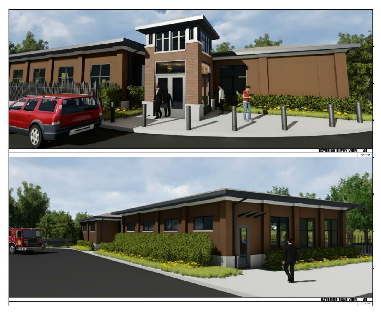
Figure 2: Rendering of Training/Classroom Facility

In September 2021, the modular building design-build Request for Proposals (RFP) was advertised, and the City received responsive proposals from three vendors. On January 4, 2022, the modular building design-build purchase order was awarded to Meehleis Modular Buildings (MMB) as the lowest qualified bidder. MMB has since completed its modular building design in coordination with PEA's design of the site improvements. PEA has incorporated MMB's building plans into a site design package that provides the site utilities and improvements needed to support the new training/classroom building (see Figure 2).