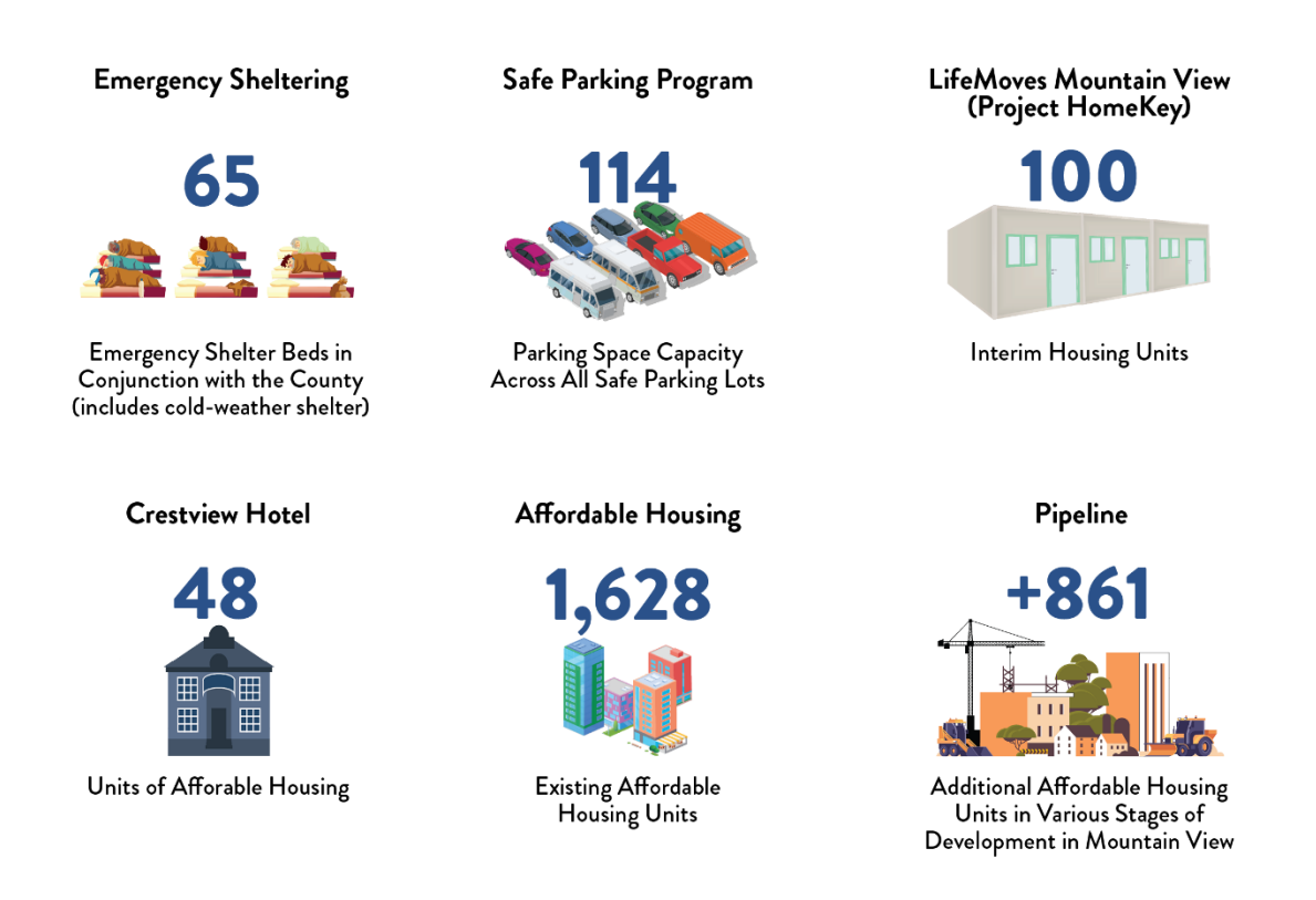
Figure 2: Key Actions to Increase Housing Options Along the Continuum of Care

Authorization to Extend Operation of the Safe Parking Lots and Execute Various Agreements to Provide Annual and One-Time Funding for Homeless Services Programs June 27, 2023 Page 5 of 15